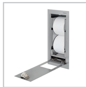
saniApp toilet paper holder