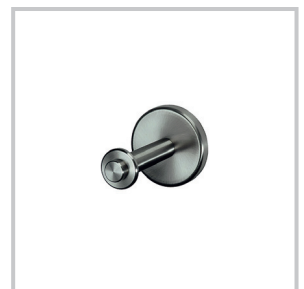
saniApp wall hook for toilet paper rolls or clothes