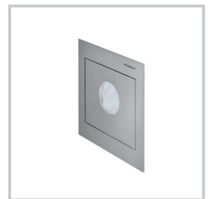
saniApp sanitary bag dispenser with magnetic locks