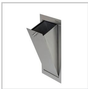
saniApp waste bin (approx. 5 liters holding capacity)

The saniQub cubicle system can be equipped with saniApps, the exclusive range of high quality accessories, providing functional design solutions uniformly integrated into the dividing wall. The saniApps, made entirely of brushed stainless steel, range from standard equipment such as brush sets or toilet paper holders to stainless steel mirrors and air fresheners offering practical design and a stylish appearance. The convenient KEMMLIT accessories for public washroom facilities can easily be purchased through the KEMMLIT online shop at shop.kemmlit.de . It is also possible to use standard products and accessories.