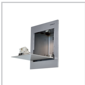
saniApp air freshener with magnetic locks