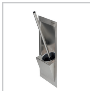
saniApp brush set