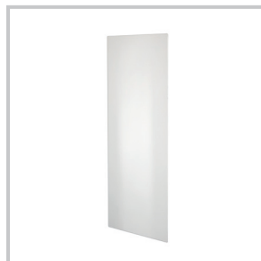
saniApp stainless steel mirror in different sizes