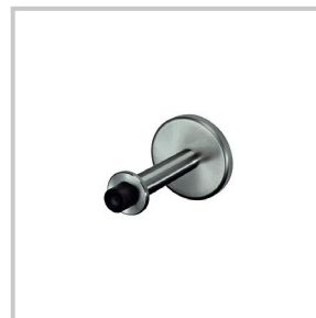
saniApp door stopper hook